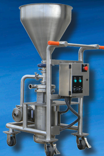
AC+ Dry Blender System