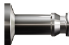
900096 ADAPTER W9/TC