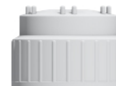
260426 LID PP BOTTLE W/HOLE 4000/5000 ML