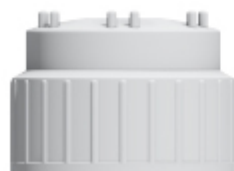
260428 LID PP BOTTLE 4000/5000 ML