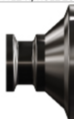
800014 ADAPTER TC/1"