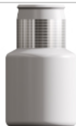
260325 PP BOTTLE 250 ML