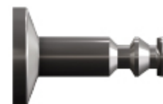
900097 ADAPTER M4/TC