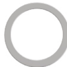
260327 GASKET PP 250-2000 ML