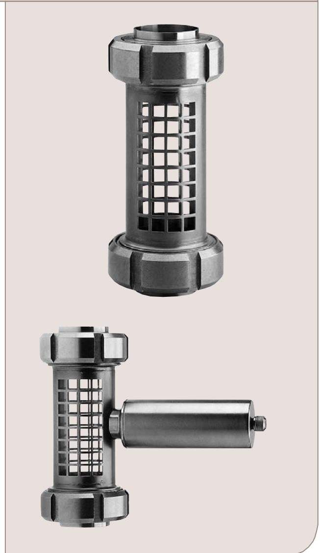
Upper: LKGG-1, In-line sight glass. Lower: LKGL-1, In-line sight glass.